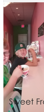
Sweet Frog Event